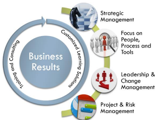
Jaguar-APS Business Excellence Framework

As the world of supply chain revolves more and more around the efficiencies and high customer service, low cost and having the product at the right time, the right place and in the right quantity, and around multi-echelon collaboration across extended supply chains that are demand-driven, more and more corporations are realizing that to train supply chain professionals on how they can better forecast, plan and run their projects, is not supporting the need of transparent organization where silos block the effective communication.